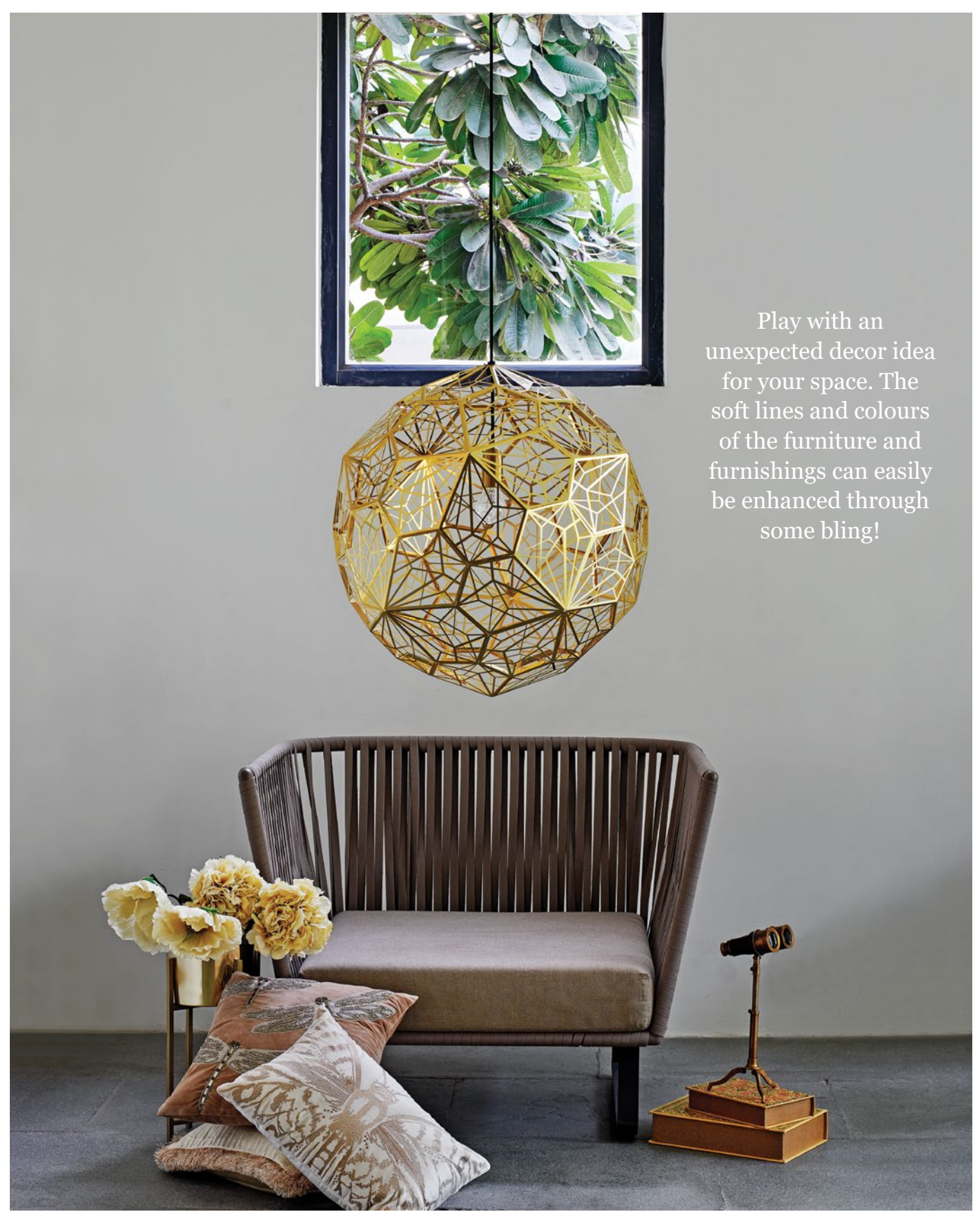
Linea gold metal planter, ₹5,590, Dragonfly camel cushion, ₹3,000, Beige fringed cushion, ₹1,600, Papillon off white cushion, ₹2,500, Off white poppy flower, ₹590, Shakespeare storage box, ₹1,650 (big) & ₹1,160 (small), all from Address Home ; Leather binocular on stand, ₹7,260, Apartment 9 ; Etch Web Brass Pendant from Tom Dixon , ₹57,850, available at Light&you.com , Bitta club armchair from Kettal, ₹2,23,590, available at Vis-a-Vis