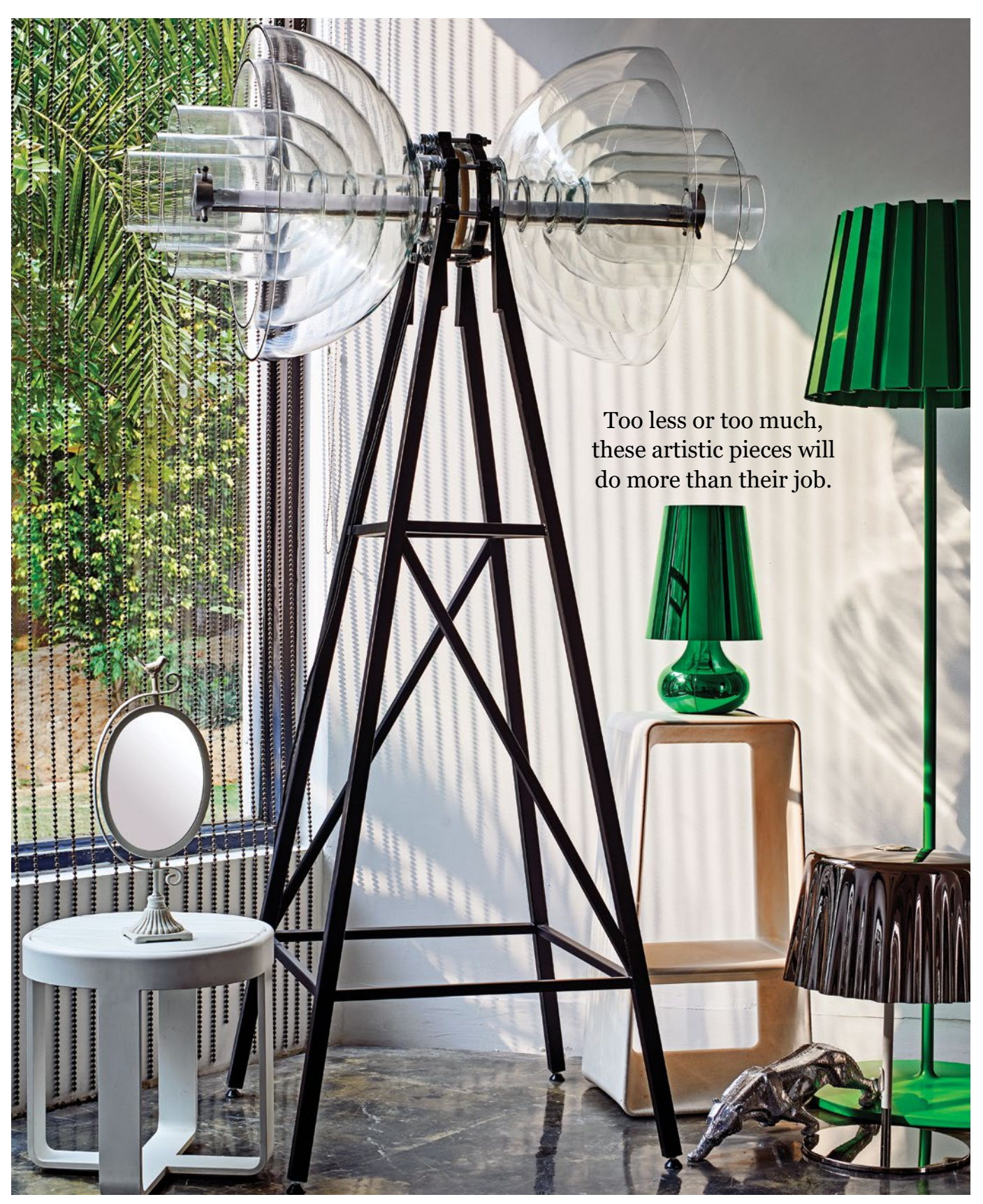
Herculean panther silver, ₹6,290, Address Home; Cloth table lamp from Vistosi, ₹57,195, Transmission floor from Lasvit, ₹12,95,272, Cindy table lamp from Kartell, ₹18,150, Tank floor lamp from Slamp, ₹69,480, all available at Vis-a-Vis, Air Taburete Alto from Gandia Blasco, ₹9,200, Flat side table from Gandia Blasco, ₹40,800, both available at Light&you.com